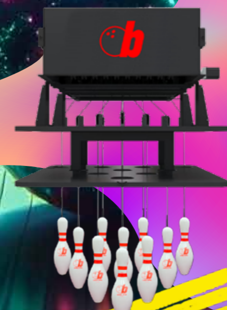
EASY STRINGPINSETTER ECO 3.0