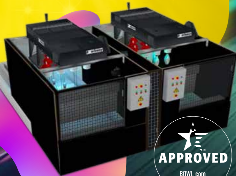
EASY STRINGPINSETTER 1.0+2.0

The Bowl-Easy 3.0 string pinsetter is a budget machine with nearly all the specs above but with a different price tag. Ask us!